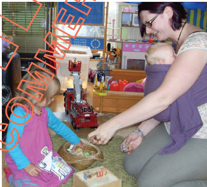
Happy toddler, happy baby. Win win situation!

Many parents worry about how they are relating to their baby, from recognising their needs and developing a good bond to fears about 'spoiling' their baby by responding to their cues. You may be confused by conflicting advice from friends, family, professionals and parenting experts.